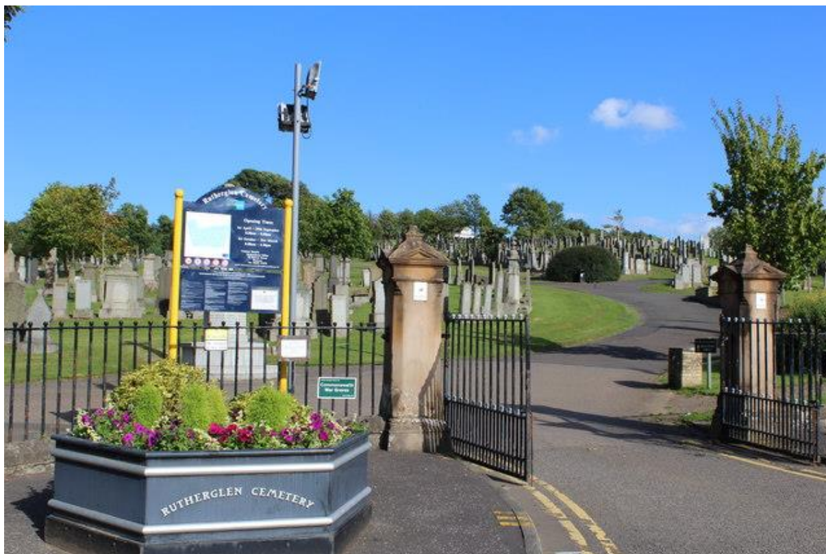
Rutherglen Cemetery

Rutherglen Cemetery, Rutherglen contains 87 Commonwealth War Graves – 49 relate to World War 1 & 38 are from World War 2.