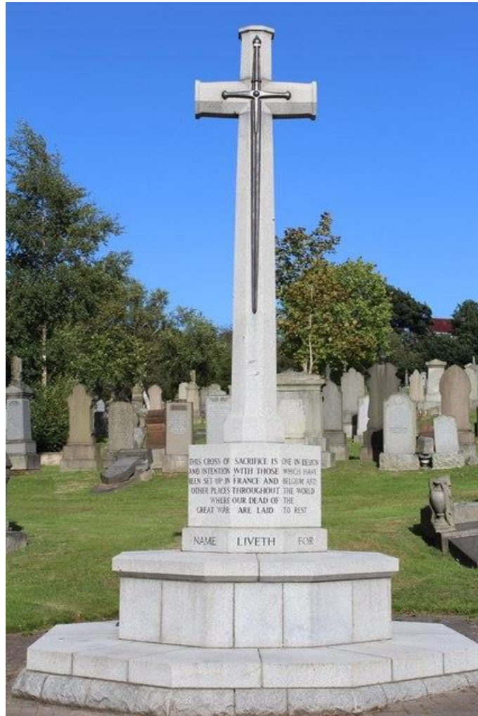
Cross of Sacrifice, Rutherglen Cemetery